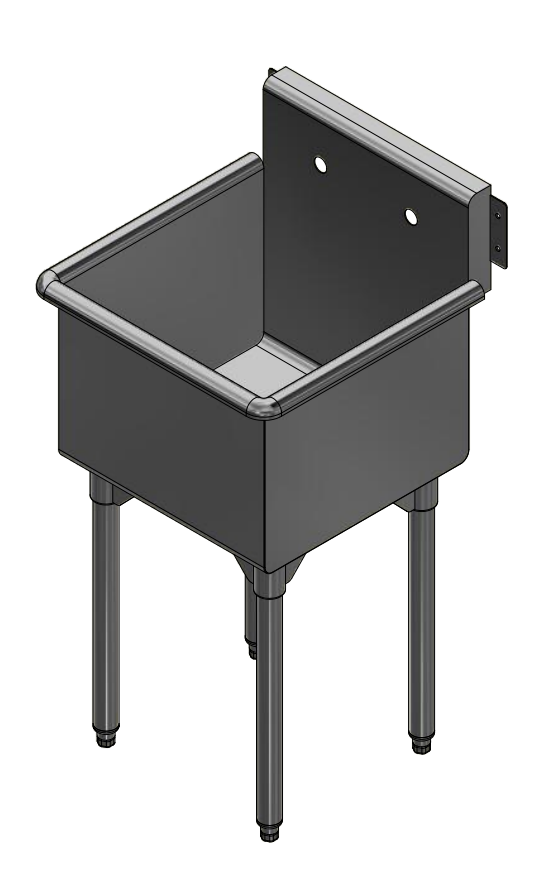
3D SCALE 1/12