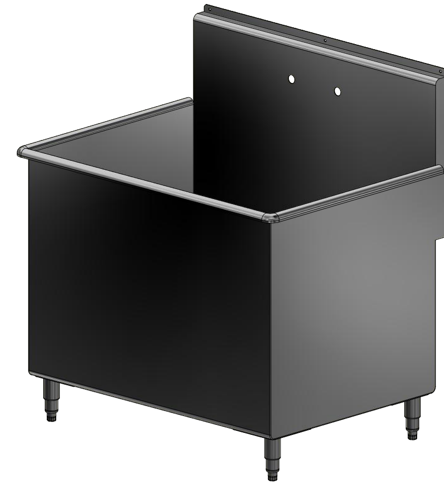
3D SCALE 1 / 12